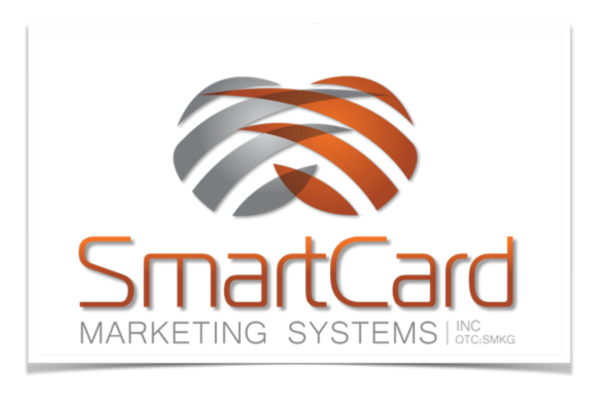
Paytech & Fintech specialized Industry applications innovator!